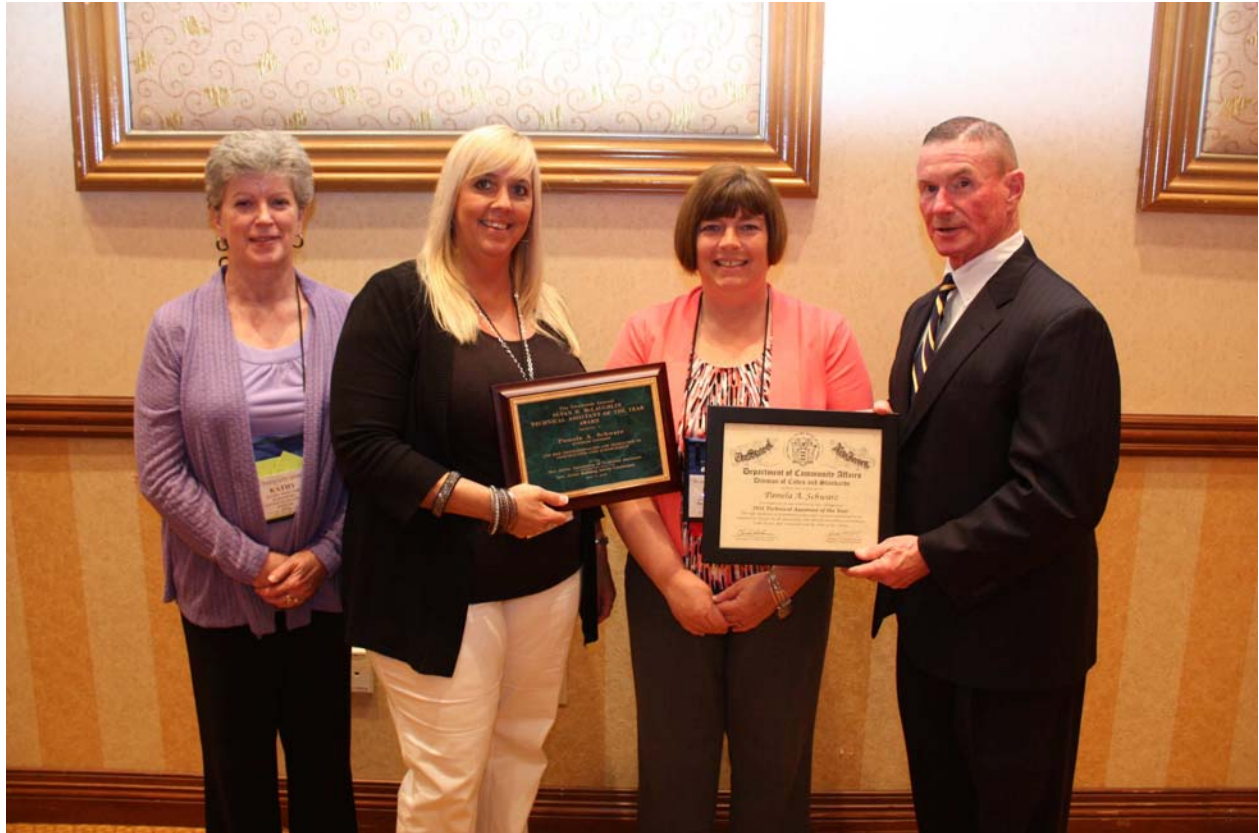
New Jersey Association of Technical Assistants